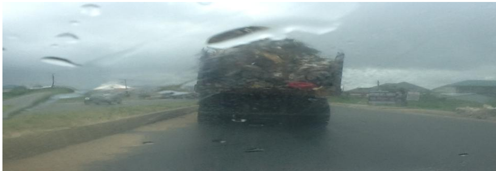
Figure 2: Exposed Sanitation Waste Disposal Truck Along Sani Abacha Express Way.

sides of Amarata, Ekeki, Opolo market, and Swali market dumps, and worst of all at Edepie community off Tombia Amassoma road, which is used as the central refuse dump for the entire Yenagoa metropolis, have turned to a good feasting place for vultures and scavengers, causing nuisance to motorists, air pollution and making the entire environment stinking and uncomfortable for human beings to live and could contribute to contracting diseases as well as leading to unhealthy environment.