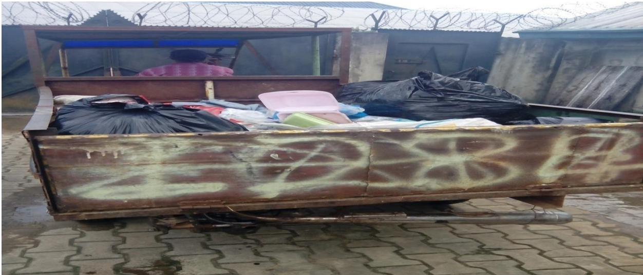
Figure 1: Locally Constructed Waste Disposal Push Cart.