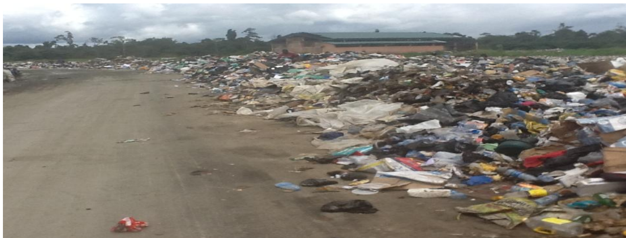
Figure 3: Central Dump Site, Off Amassoma Road, Edepie-Yenagoa.

rate and poor planning, which has not only affected solid waste volume but also made solid waste management strategies incapable of keeping pace with the rate of generation.