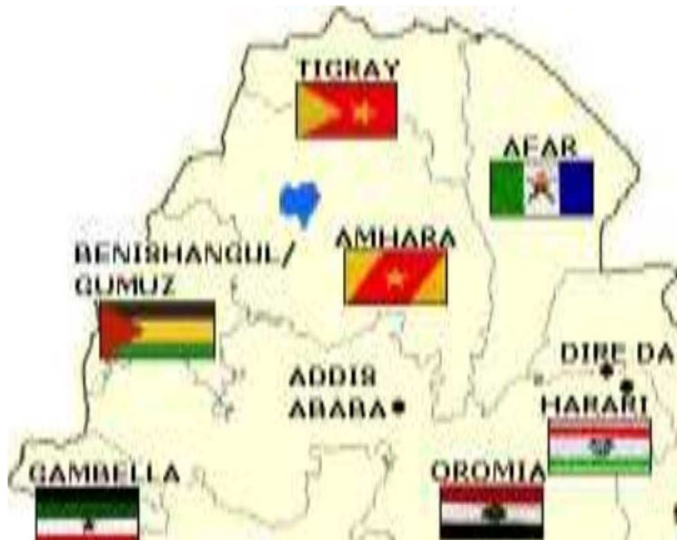
Figure 2: Nine Regional States in Ethiopia (1994-2020)

When the TGE was ended and the new constitution was promulgated, the 14 national/regional governments under the Proclamation 7/1992 were reduced to 9 regions and two self-autonomous city administrations. With this, the name of regional administrations was changed from numbering to regional state. Furthermore, Keilil 7, 8,9,10 and 11 were amalgamated to form a single regional state called the SNNPRS. However, majority of the remaining regions were named following the language (and culture) of the ethnonational groups residing within that particular area.