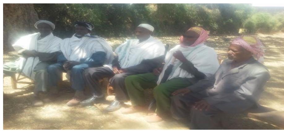
Figure 3. Members of libidan dummichcha Maaga

before the court, he/she has the right to hear the case in written or verbally by the accuser and asked to admit or refute regarding the claimants claim.