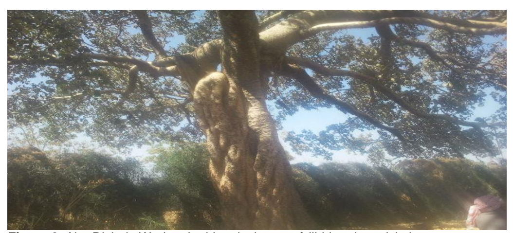
Figure 2; Aba Dishele Warka, the historical venu of libidan dummichcha

consent of both conflicting parties unless he cannot set as a Maaga in the conflict resolution process. Both parties may also commonly choose one Maaga to chair the conflict resolution process that they think are neutral and transfer the conflict peacefully and partially and who is known for his reputation. However, sometimes the Maaga , who are selected for the resolution or by third party who initiates the conflict resolution process, might select the chair Maaga . Generally, the conflict resolvers at hegeegan janna structure ranges about seven to nine depending on the complexity of the conflict. However, anyone can attend the conflict resolution process.