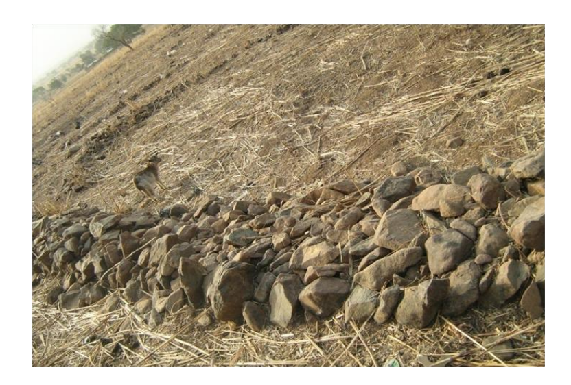
Figure 3: Photo 1. shows stonebunds, source: field survey, 2014.

stonebunds, earthbunds, vertiver grass, manure, local grass, tree planting, drainage trench, wood logs and ploughing across slope. Among the conservation methods adopted by the farmers, stonebunds has the highest percentage 20%, followed by earthbunds 15%, vertiver grass 12%, manure 10%, local grass 12%, tree planting 9%, drainage trench 8%, wood logs 4% and ploughing across slope 9% as shown in Figure 2.