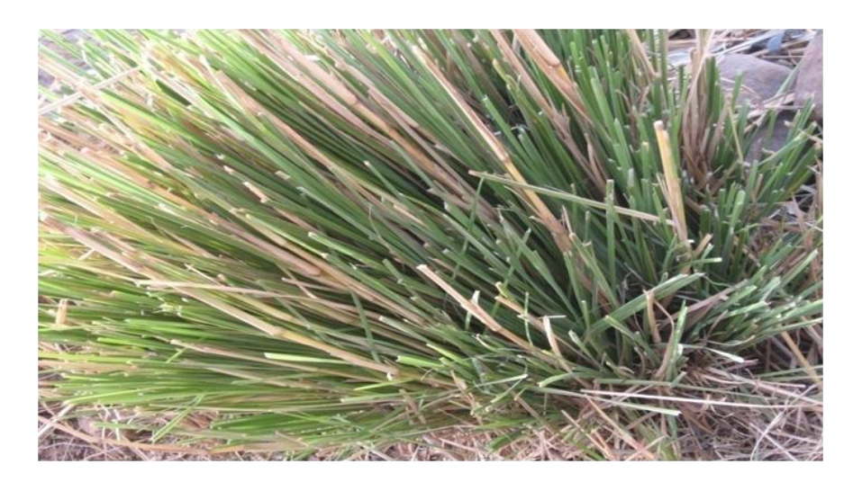
Figure 4: Photo 2. shows vertiver grass, source: field survey, 2014.