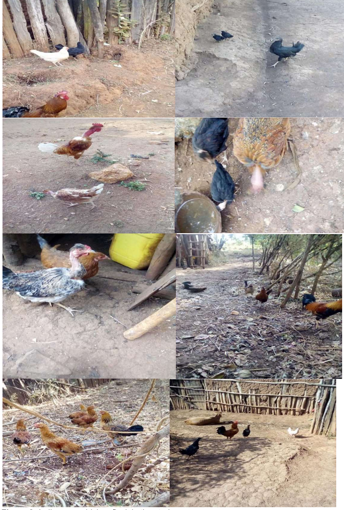
Figure 2: Indigenous chicken flock in the study area