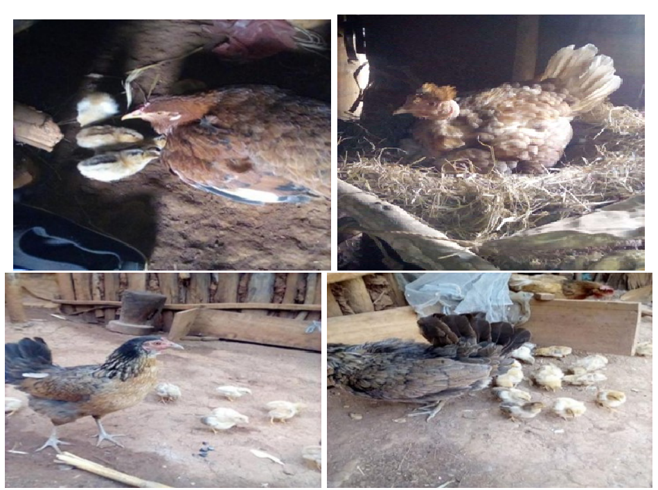
Figure 5: The live weight of the naked neck and normal feathered