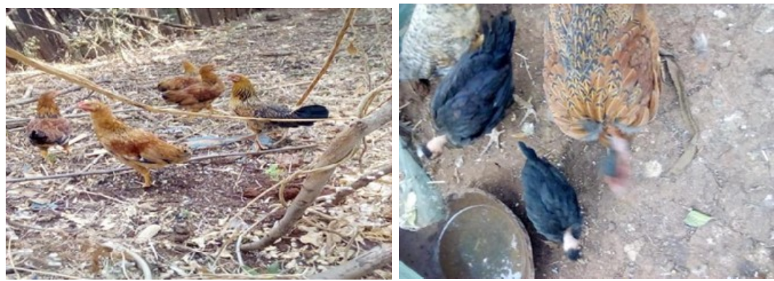
Figure 3: Local chicken scavenging in the backyard area

According to this finding, the most dominant chicken production system in both midland and lowland agroecology was about (89.33 percent) traditional or extensive systems in which feeding system was mainly focused on scavenging with seasonal supplementary feeding. Around 10.67% of the farmers, however, adopted semi-scavenging production systems (scavenging with daily supplementation feeds for their chickens (Table 5 and fig 3). Whereas in the study area, the intensive chicken production method was not familiar. This result was similar to Yadessa et al. (2017); Bekuma (2018); Asmamaw (2016) who reported the majority of the chicken production systems are the traditional/village chicken production system with scavenging and occasional supplementation of feed such as cereal crops in different parts of the country. The overall proportion of 71.55 percent and 28.45 percent of respondents in the Southwest Showa and Gurage had extensive and semi-extensive management systems respectively (Emebet, 2015).