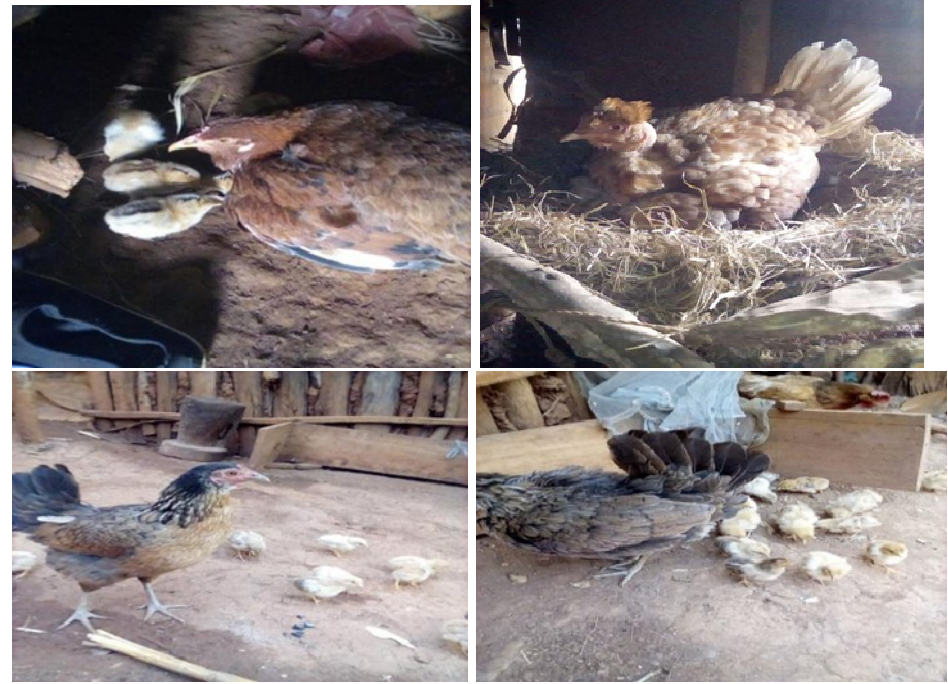
Figure 4: Incubation and hatch of indigenous chickens