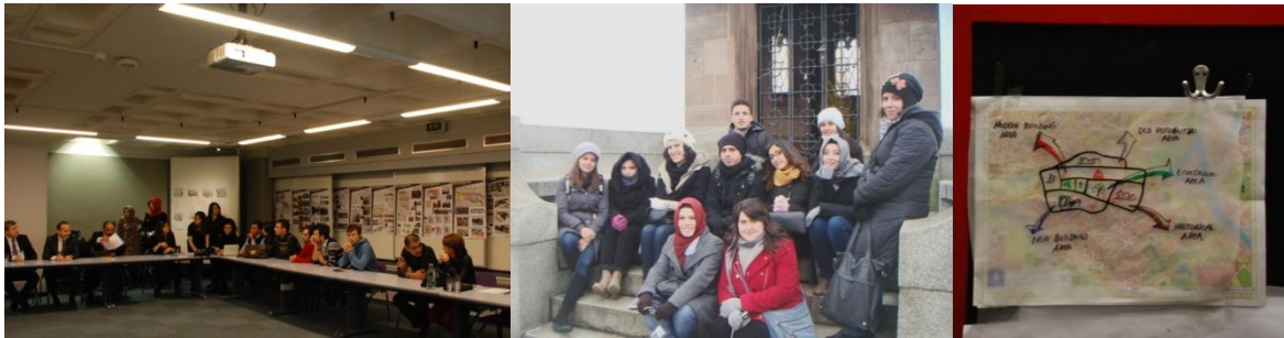
Figure 6. Photographs from the Strasbourg Workshop.

places in different countries including for areas of a city that failed to integrate into the life of its region and environment. The students were required to solve multiple problems in a short time; they had to work fast, in harmony with one another and in coordination through a real exchange of knowledge and cooperation. They were also required to complete their project despite the limited time.