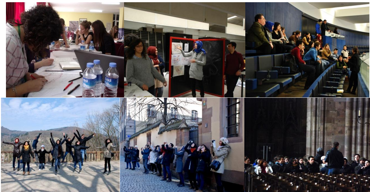
Figure 4. Photographs from the Strasbourg Workshop.

Strasbourg – Neudorf region with the participation of 15 French and 15 Turkish students and was facilitated by 5 French and 5 Turkish academics. (Figure 4).