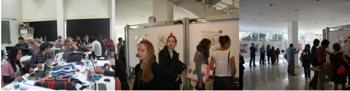
Figure 1. Photographs from the Germir Workshop.