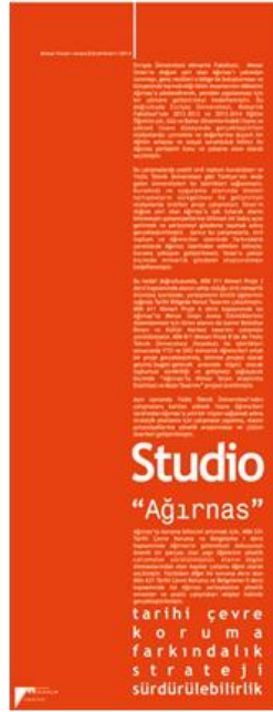
Figure 8. The Exhibition Poster of Studio Ağırnas(2014).

place of the great master Sinan the Architect. They aimed to familiarize the younger generation with the area whilst drawing the attention of the scientists of the university thus enabling an opportunity and the environment for its development and reconstruction. In this connection, the Faculty has cooperated with Ağırnas Municipality. As part of this cooperation, all appropriate studio works and other practical courses for the academic year 2012-2013 were directed towards this urban area. As a parallel event, during the course of the cooperation between Erciyes University Faculty of Architecture and Yıldız Technical University, Ağırnas was proposed as a working platform. Yıldız Technical University focused on Ağırnas during some of its graduate and post-graduate classes. As a result, 120 architecture students from Yıldız Technical University, 226 from the Erciyes University Faculty of Architecture as well as 57 academics in total worked on Ağırnas. (Figure 8).