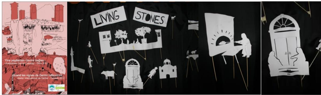
Figure 2. Created Posters from the Germir Workshop (2012).