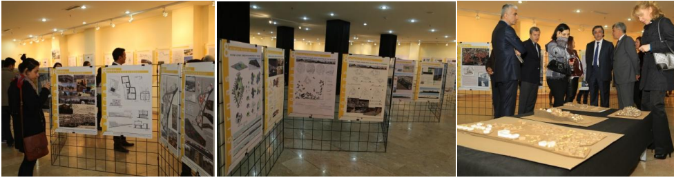
Figure 7. Photographs from the “Studio Ağırnas” Exhibition.