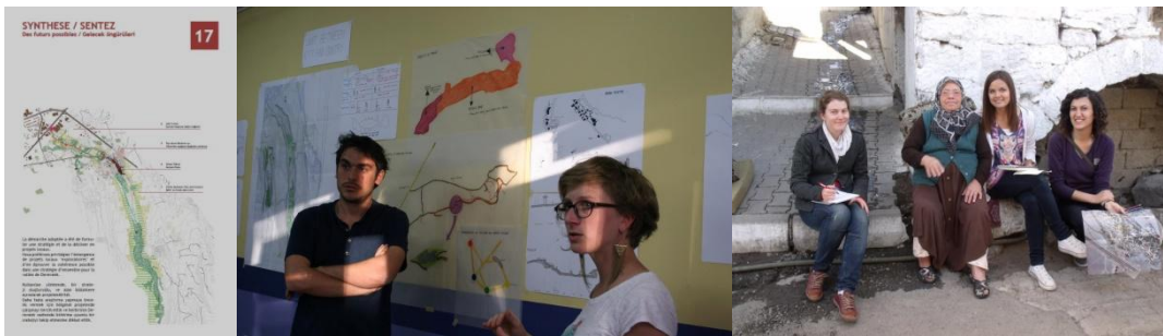
Figure 3. Photographs from the Germir Workshop.

Kayseri Metropolitan mayor and the Erciyes University Rector, Representatives of the Embassy of France, municipal council members of Kayseri and Strasbourg, the muhtar (selected village head), the inhabitants of Germir, the lecturers, the students and members of the press. Before the meeting took place where the results were assessed, an exhibition was held displaying the products that had been created in the course of the workshop. This exhibition was inaugurated at the exhibition Hall of Kayseri Metropolitan Municipality with an international protocol and admitted the public for one